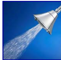
3-Function Showerhead with 1.25gpm turbine spray