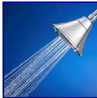
3-Function Showerhead with 1.7gpm spray

As these showerheads are not yet available in retail stores, the City of Woodstock has partnered with a manufacturer and a local supplier to offer a premium reduced rate for this "Special Buy", available from June 1, 2008 for a limited time, at the City Engineer's Office.